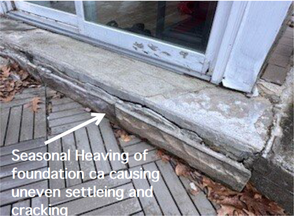
Seasonal Heaving of foundation ca causing uneven settling and cracking