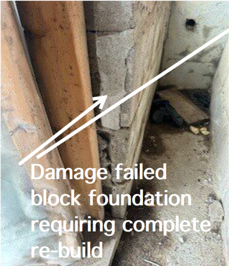
Damage failed block foundation requiring complete re-build