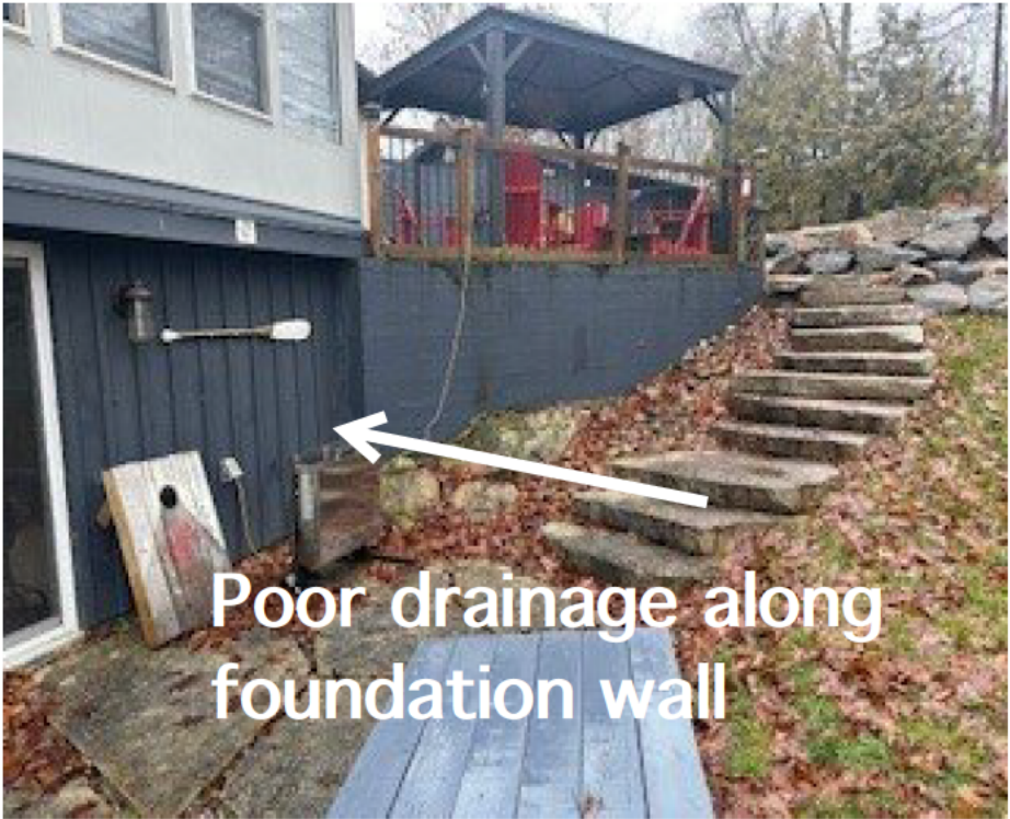
Poor drainage along foundation wall