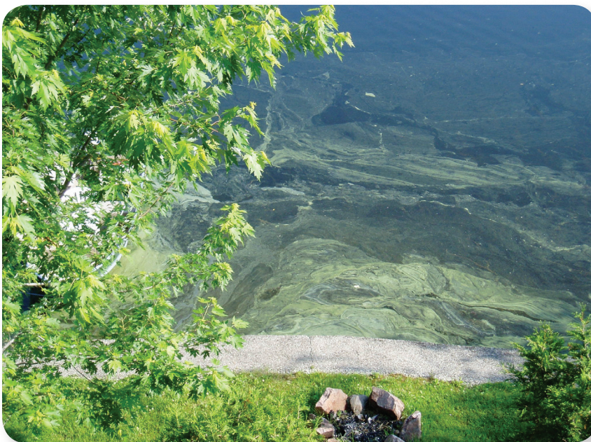
Colonies of microscopic blue-green algae appear on a lake during a bloom. Blooms occur mostly during late summer and early fall.

Human activities can promote the growth of blue-green algae. For instance, agricultural, urban and stormwater runoff, effluent from sewage treatment plants and industry, and leaching from septic systems can elevate the levels of nutrients in water bodies, which can promote algae growth. Reducing or eliminating nutrient inputs from these sources is a proactive way to reduce the occurrence of blue-green algal blooms.