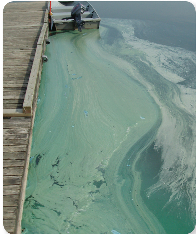
Blue-green algae thrives in warm, shallow, slow-moving water. Blooms are commonly found near docks and shoreline areas.

The Ontario Drinking Water Quality Standard for microcystin-LR (a common algal toxin) is a maximum acceptable concentration of 1.5 micrograms per litre, which is the same as 1.5 parts per billion. It is rare for treated water tests in Ontario to exceed this standard, but precautions should still be taken when a bloom occurs.